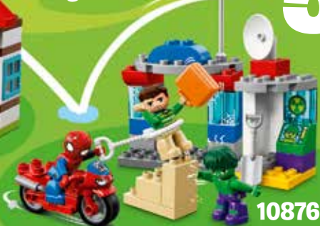
10876 Ages 2-5