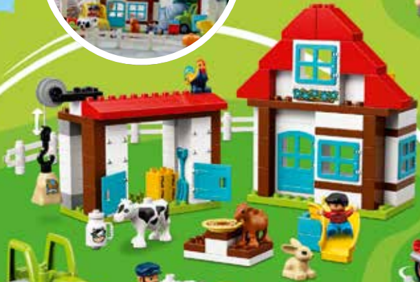
10869 Ages 2-5