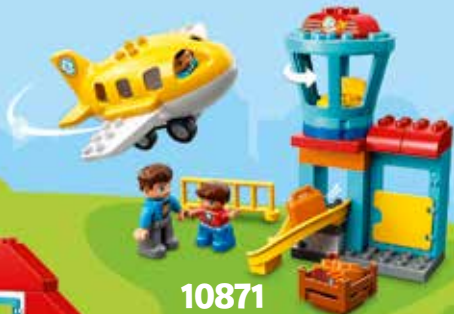
10871 Ages 2-5